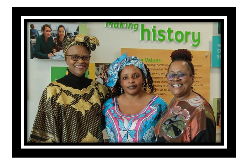
Ubuntu ~"I am because we are!"

The African American in America comes from a rich cultural heritage of African kings, queens, philosophers, artists and scientists and, like the rest of the world, is linked to the earliest man whose remains were found in Africa. This means regardless if we are European American, Mexican American, Filipino American, Latin American, Asian American, Native American, or African American, we are all Americans who are connected to or come from Africa – the world's Motherland.